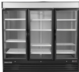
MXM3-72RB (Color: Black)