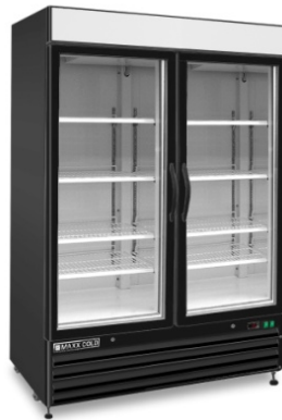
MXM2-48FB (Color: Black)

Glass Door merchandisers are designed for durability and visual appeal in promoting your product. Glass door merchandisers are energy efficient and effective at keeping product at exactly the right temperature. This keeps food fresher for longer. The simple-to-use but precise digital controls allows for accuracy in temperature and flexible use of the unit.