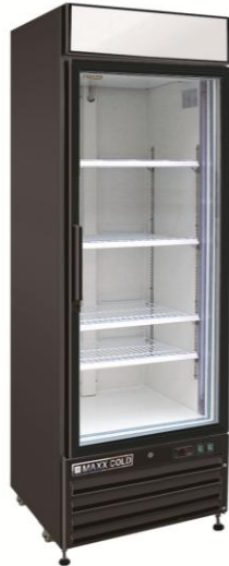
MXM1-23FB (Color: Black)

Glass Door merchandisers are designed for durability and visual appeal in promoting your product. Glass door merchandisers are energy efficient and effective at keeping product at exactly the right temperature. This keeps food fresher for longer. The simple-to-use but precise digital controls allows for accuracy in temperature and flexible use of the unit.