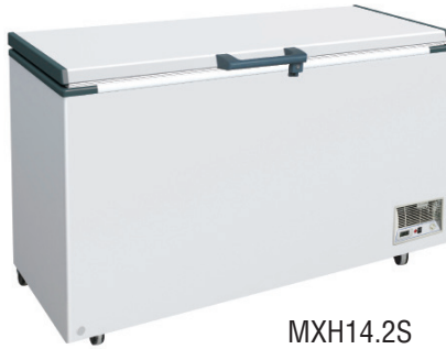
MXH14.2S 13.4 Cu Ft