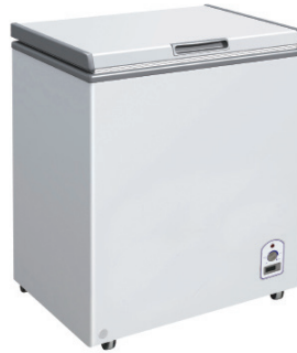
MXH7.1S 7.1 Cu Ft