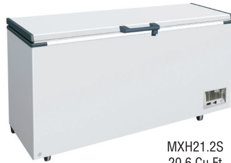
MXH21.2S 20.6 Cu Ft