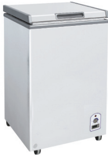
MXH3.5S 3.3 Cu Ft