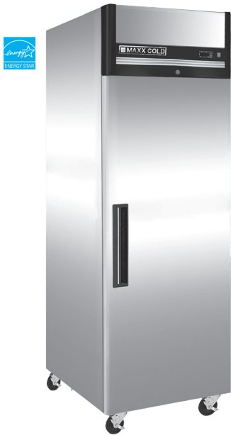
MXCR-23FD / MXCF-23FD

MXCR-23FD MXCR-49FD MXCR-72FD REACH-IN REFRIGERATORS MXCF-23FD MXCF-49FD MXCF-72FD REACH-IN FREEZERS