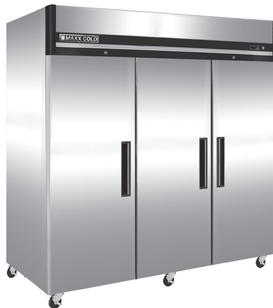
MXCR-72FD / MXCF-72FD