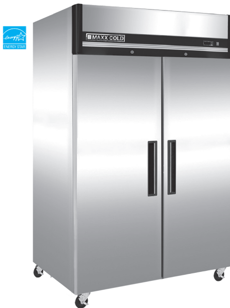
MXCR-49FD / MXCF-49FD