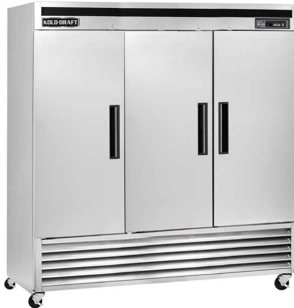
KMXCR-72FD / KMXCF-72FD