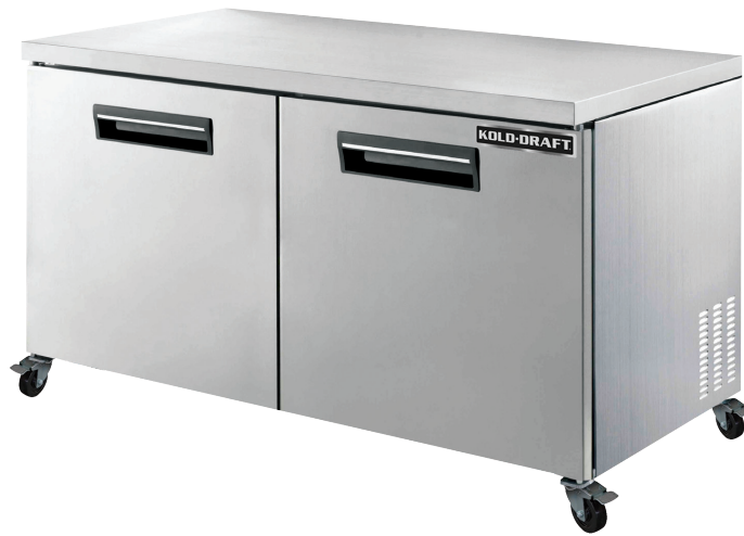
KMXCR-60U / KMXCF-60U