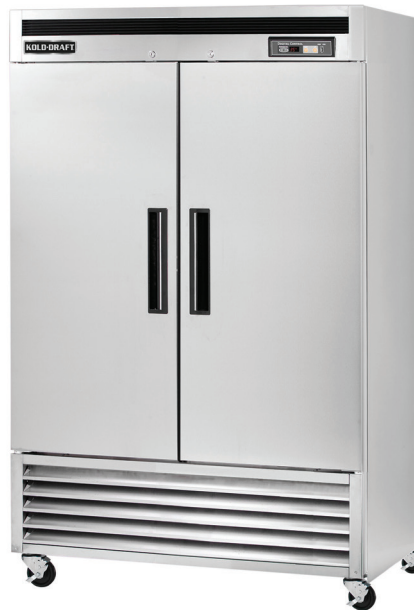
KMXCR-49FD / KMXCF-49FD